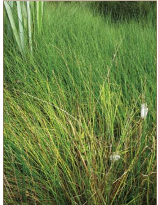
Like raupo, sedges have high nutrient demands. Lake Hakanoa, Waikato.

Point source pollution: farm drains frequently channel dissolved nutrients (nitrogen) and nutrients bound to sediments (phosphorus) directly into wetlands and waterbodies. Waiwhakareke, Waikato.