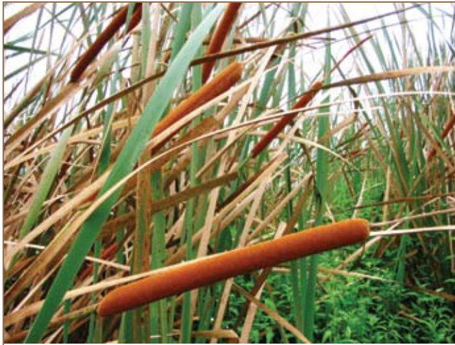
At Lake Kaituna (Waikato) raupo, an indicator of high nutrient levels is periodically removed to ensure it doesn't colonise too much of the shallow lake bed.