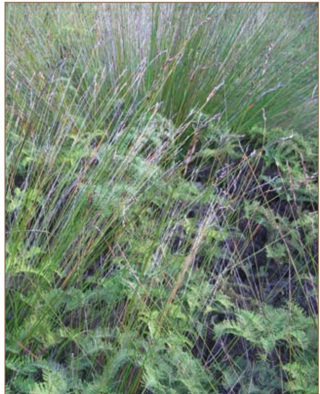
Low nutrient pakihi community, Milnthorpe Park Scenic Reserve, Nelson.