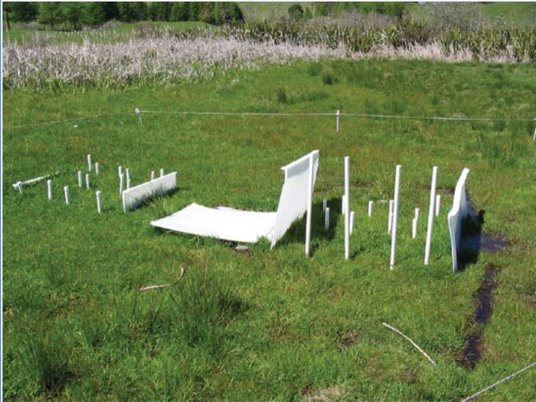
Experimental set up with piezometers