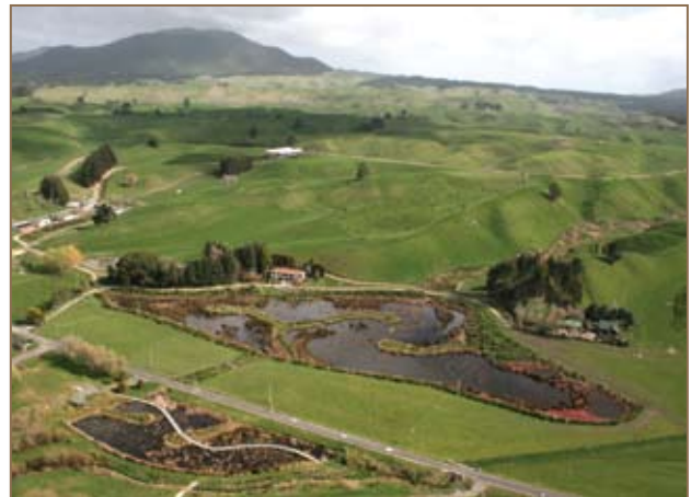
Once mature, the Lake Okaro wetland is predicted to be able to remove around 40–50% of the total nitrogen intercepted. This will complement nutrient reduction from riparian restoration and improved farming practices as well as provide wildlife habitat, enhance biodiversity, landscape and public amenity values.