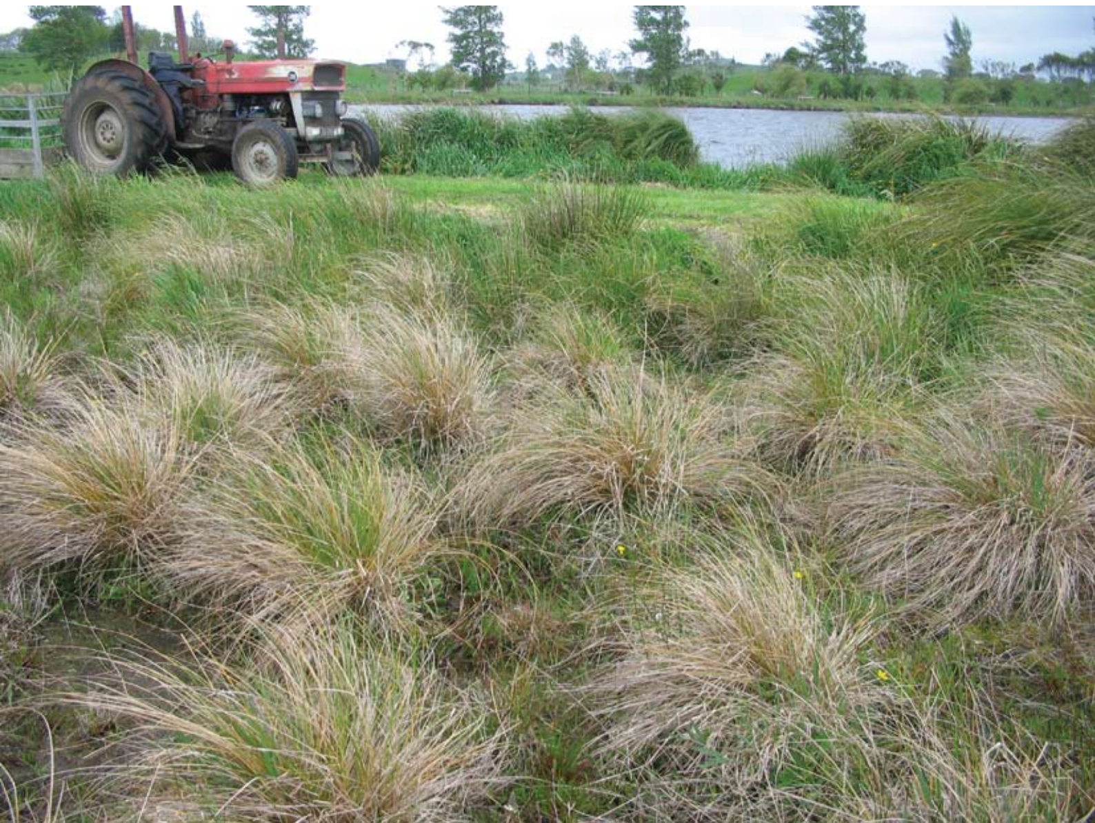
At Lake Kainui (Waikato) a shallow vegetated excavation at the end of a drain enables some nutrient removal prior to water entering the lake