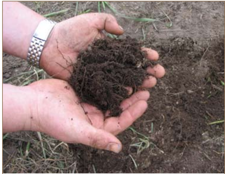
Nutrient rich sediment harvested from a silt trap can be reused away from the restoration site. Lake Kaituna, Waikato.