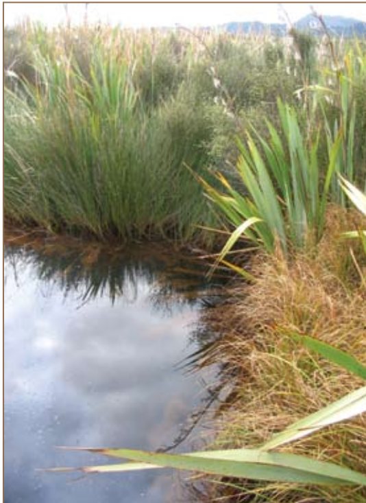
Mangarakau swamp flax community