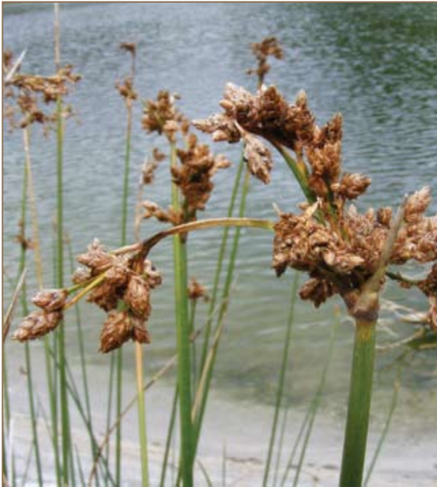
Lake clubrush ( Schoenoplectus tabernaemontani ) is commonly planted in NZ constructed wetlands.