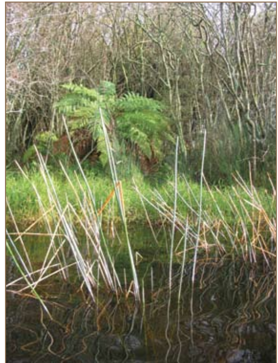
An example of a low nutrient environment: the naturally peat stained waters of Lake Serpentine east, Waikato.

The Howarth Memorial Reserve lies at the edge of the extensively farmed Hauraki Plains creating challenges for effectively managing nutrients entering the wetland from both the river and farm drainage networks