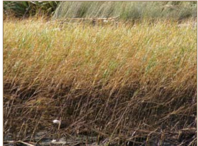
Marsh clubrushes ( Bolboschoenus medianus — pictured, and B. fluviatilis ) are useful species for providing seasonal diversity in treatment wetlands.