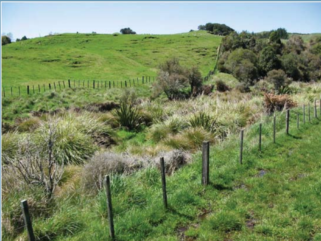
Well-fenced riparian area protecting the wetland values.