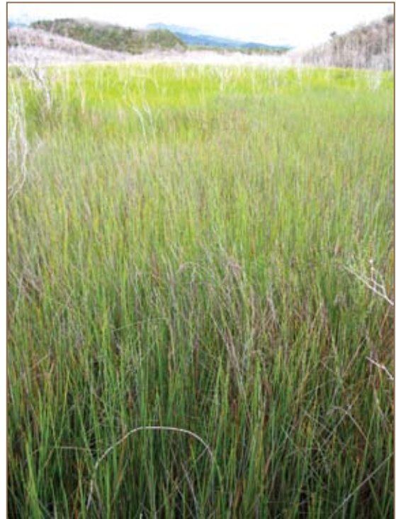
Mangarakau swamp sedge community