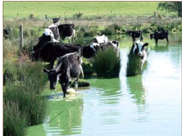
A Waikato wetland much degraded through the impact of agriculture — despite the fencing, the cows are on the wrong side of it!

availability in the wetland and the aquatic habitat. A very common scenario in wetland restoration failure is where people spend a lot of time and money establishing the correct hydrology and planting an attractive, diverse plant community, only to see species like raupo, or exotic weeds, spread explosively and completely dominate the site. Too much nutrient is usually responsible for this.