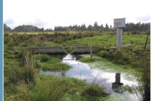
Hollow on farm in Lake Brunner catchment.