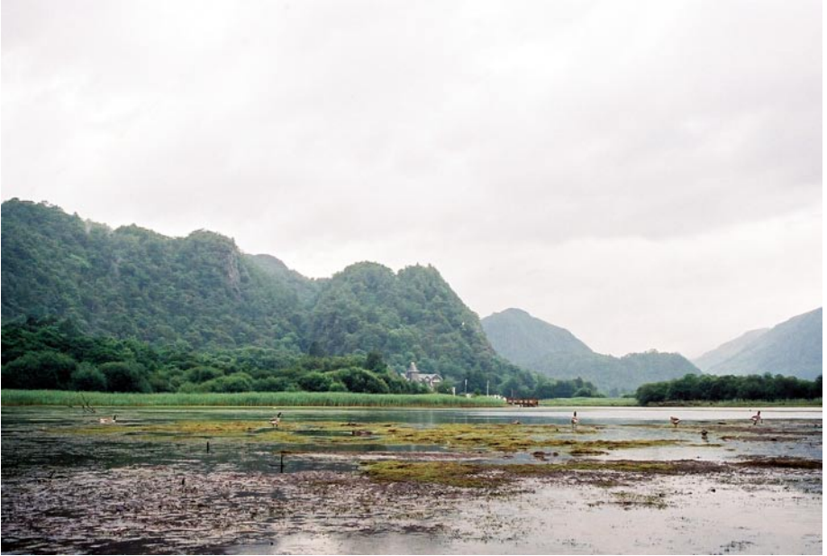
Fig. 3. Geese grazing on the southern part of the floating island, with the Lodore Boat Landings and Lodore Hotel in the background (Chet Van Duzer).