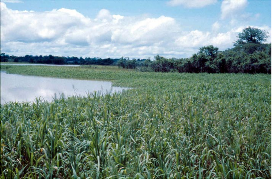
Fig. 11. A floating meadow dominated by Paspalum repens on the Central Amazon near Manaus (Walter Hödl).