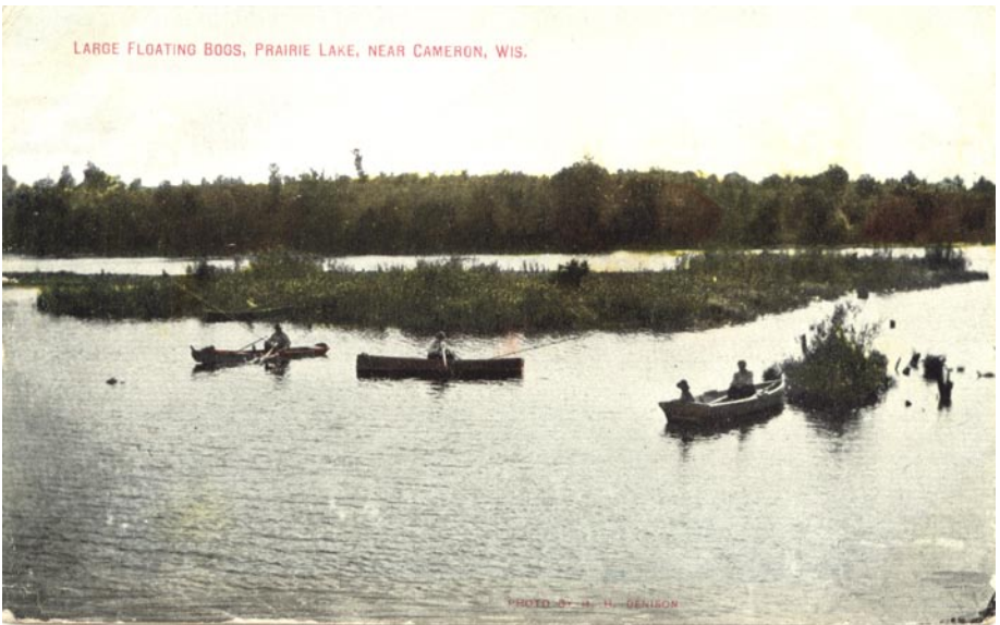
Fig. 10. A postcard postmarked 1909 showing floating islands in Prairie Lake near Cameron, Wisconsin.