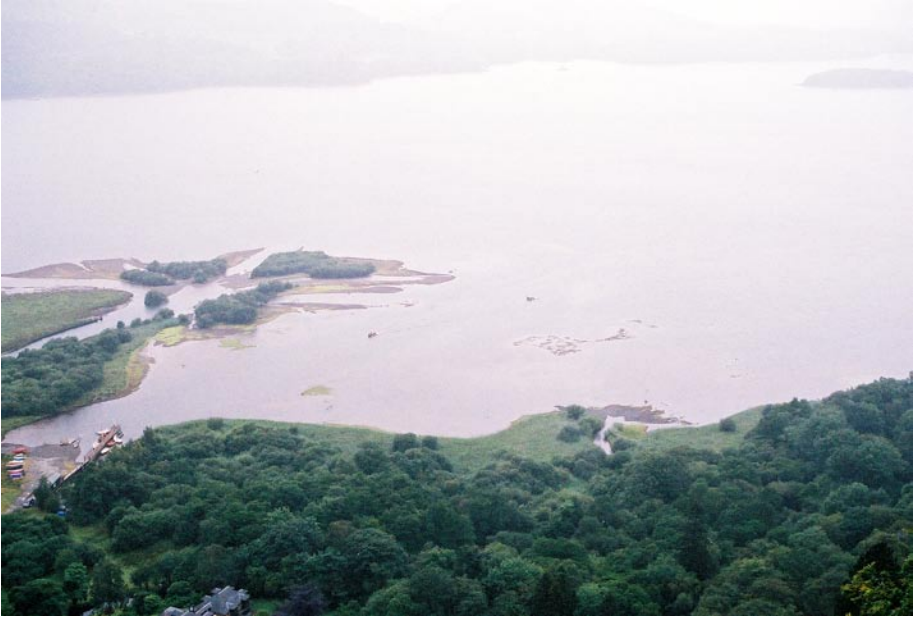
Fig. 1. The intermittent floating island in Derwentwater, just to the right of center, seen from the “Surprise View,” with the Lodore Boat Landings and the mouth of the Derwent River to the left (Sandra Sáenz-López Pérez).