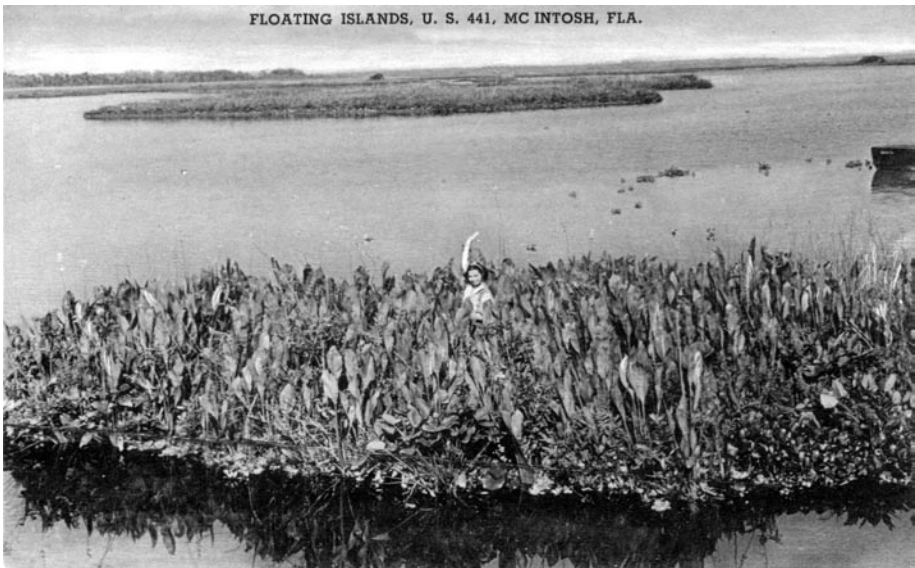
Fig. 8. An old postcard image of the floating islands in Orange Lake, Florida.