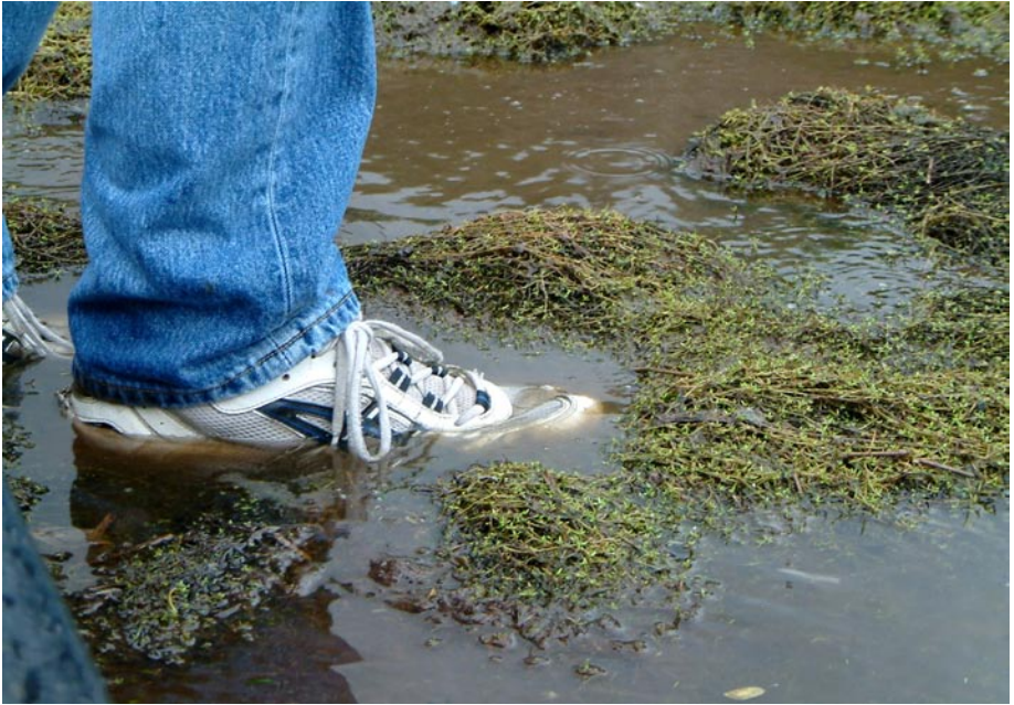
Fig. 5. The author's foot on the floating island, showing the vegetation and also how low the island was in the water (Sandra Sáenz-López Pérez).