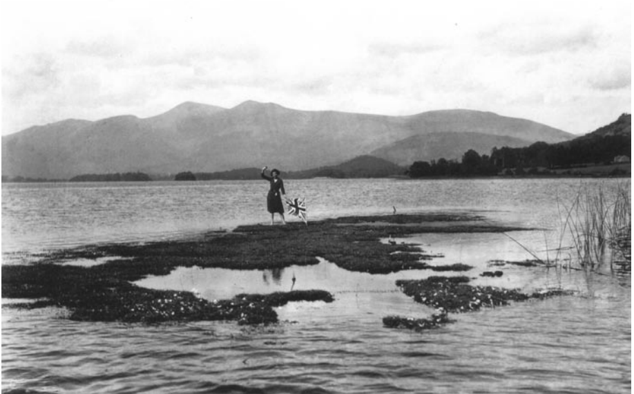
Fig. 6. An old image of a Girl Guide on the floating island in Derwentwater; the island is both higher in the water and more thickly vegetated than it was in 2005.