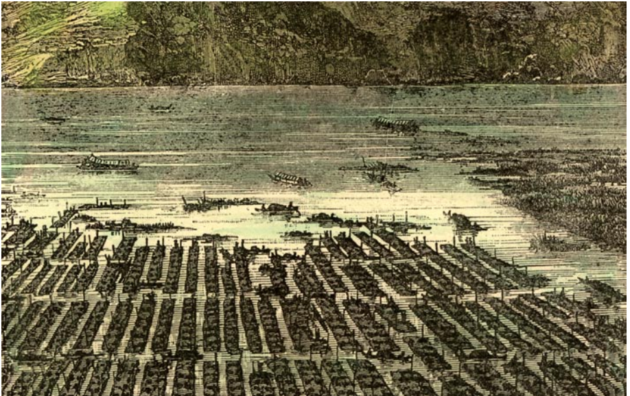
Fig. 16. Detail of a hand-tinted etching of the floating gardens of Dal Lake, India, from William Urwick's India Illustrated with Pen and Pencil (New York, 1891) (author's collection).