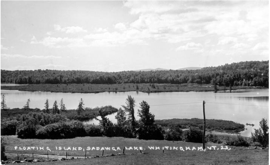
Fig. 9. An old postcard showing the large floating island in Sadawga Lake, Vermont.