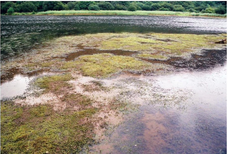
Fig. 2. Part of the northern section of the floating island in Derwentwater, showing the vegetation (Sandra Sáenz-López Pérez).