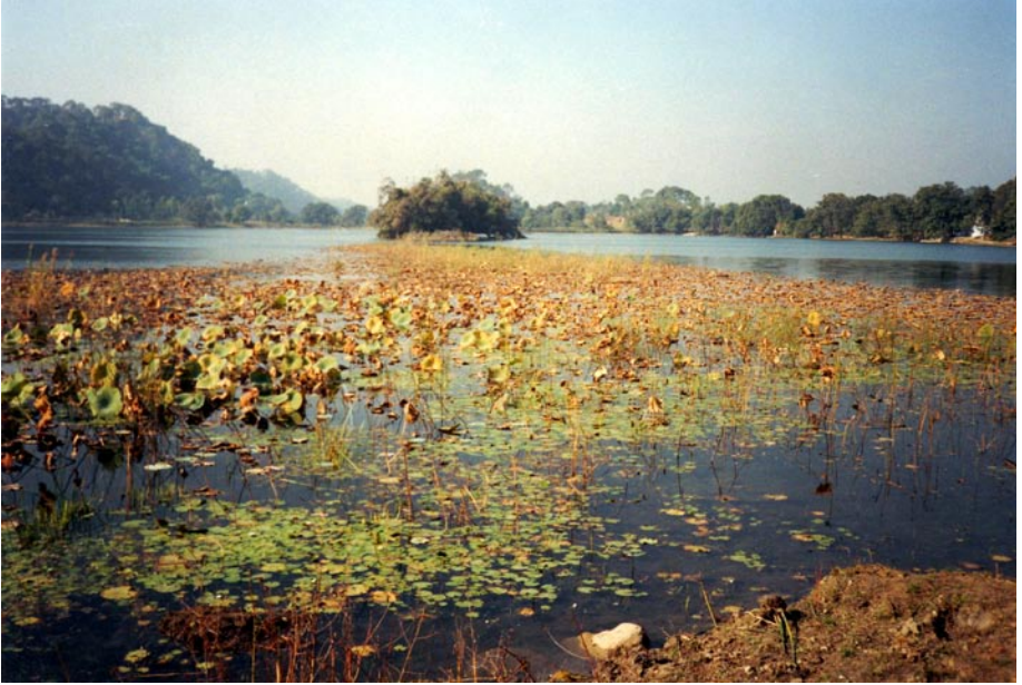
Fig. 13. The floating island in Lake Suresnar, Jammu and Kashmir, India; the island is usually stationary but does move in high winds (B. K. Das).