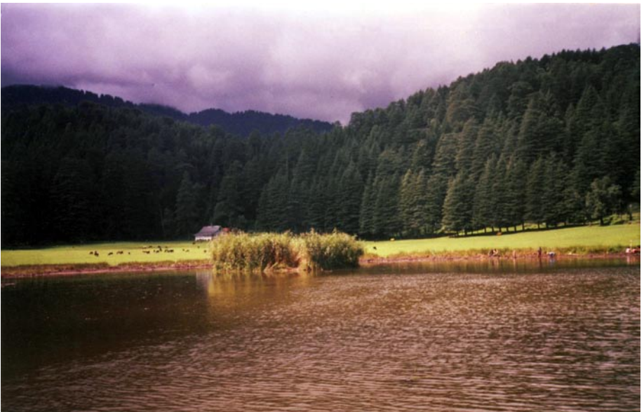
Fig. 14. The floating island in Lake Khajjihar near Dalhousie, Himachal Pradesh, India; the island moves freely about the lake (B. K. Das).