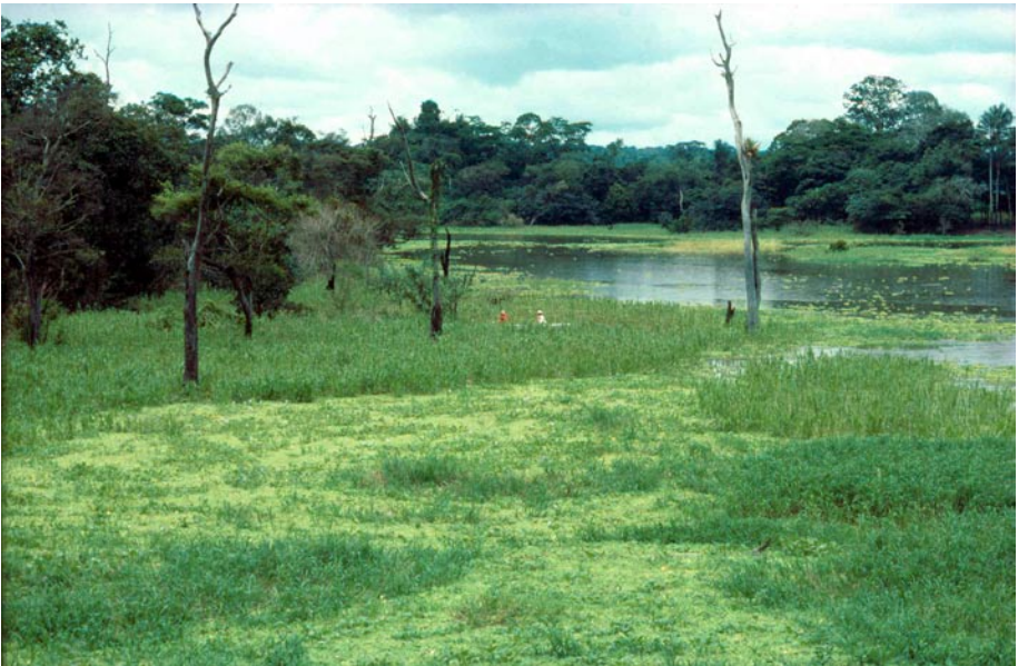
Fig. 12. A floating meadow dominated by Salvinia auriculata and Reussia rotundifolia and also with Pistia sp. on the Central Amazon near Manaus.